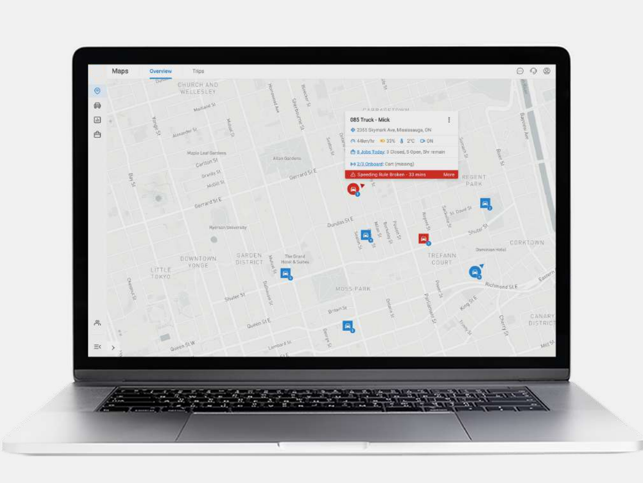
Location history - see the trips, exceptions, events. Simulate the trip on the map