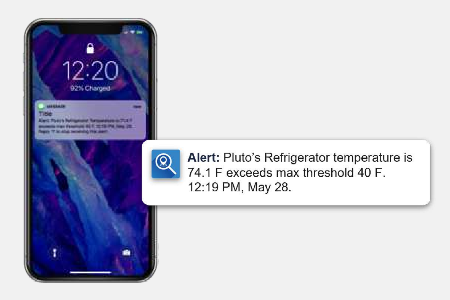
SMS, Email notification for location, environmental change, door movement