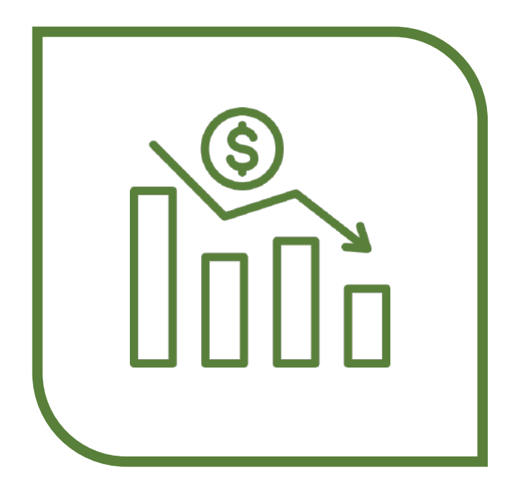
Reduce staff inefficiency and cost

Reduce the time needed to manually locate asset and save countless hours of labor