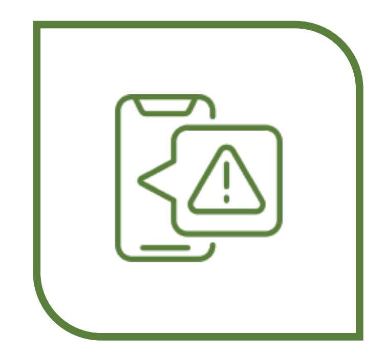
Locating missing assets & theft prevention

Automatically gathering asset data and integrating it with maintenance management software to detect potential issues and schedule maintenance