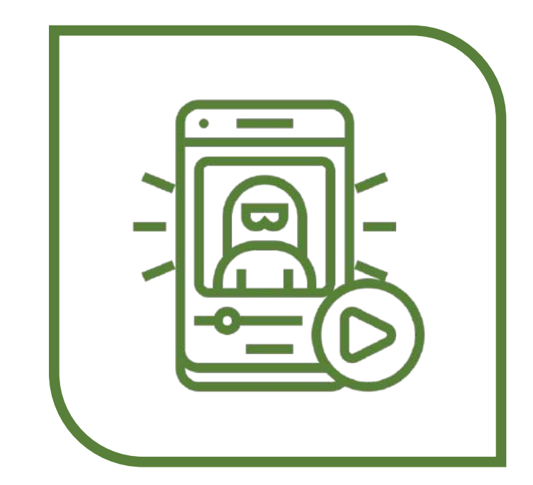
Avoid false insurance claims & exonerate drivers with video evidence stored on cloud